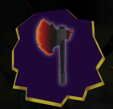
In-Game Items/ Efficiency NFTs

Awakening, and found while foraging and crafting within Fyra Oyer