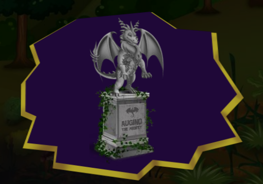
Land Enhancement NFTs

These NFTs are used to complete complex recipes, advanced quests, or increase the efficiency of a player's ability to earn their daily reward shares within Fables of Fyra: The Awakening.